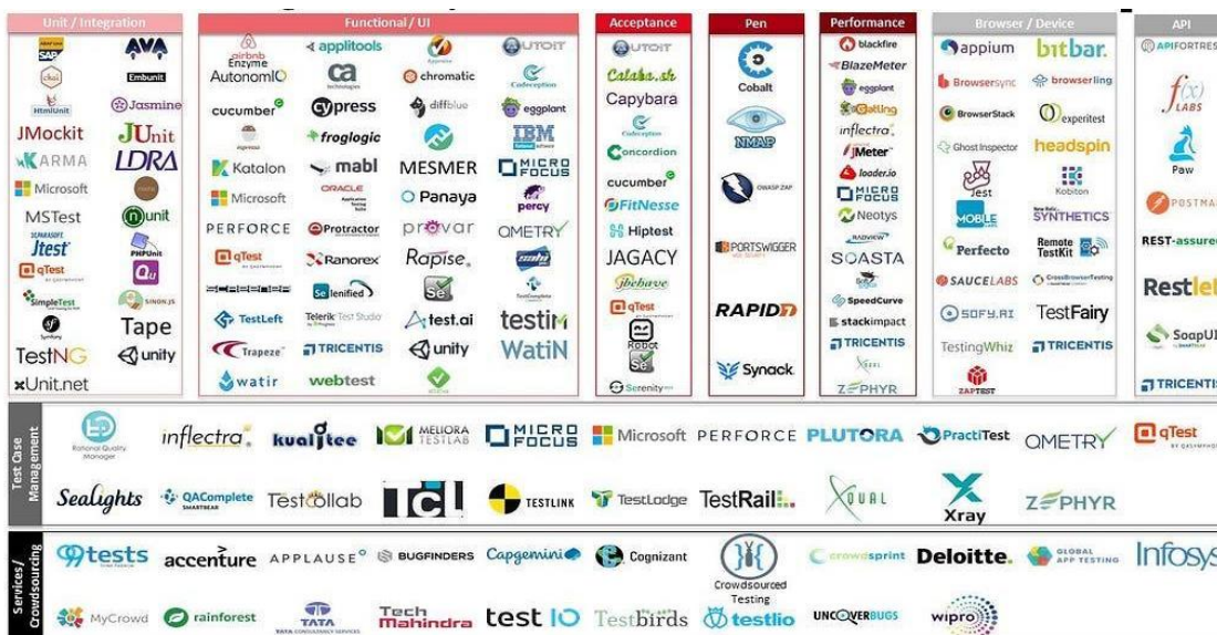
Figure 1 - Software test tool landscape [5]

Technological advancement has led to the development of new test tools that make software testing more efficient and effective. For example, there are tools available for automating test scenarios (such as Unit Testing and Functional Testing), managing test cases (such as analyzing test data and reporting test results), as illustrated in Figure 1, categorized into tool-specific focus areas.