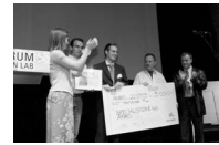
Initiative Prize 2005 IT Forum Mid-Jutland