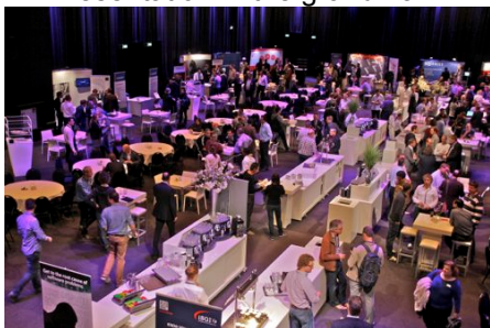
Centrally the buffet, surrounded by sponsor-stands of main sponsors.