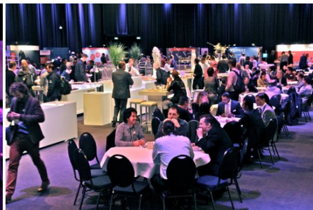
The expo with buffets for drinks and food