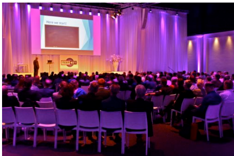
Presentation in the grand hall